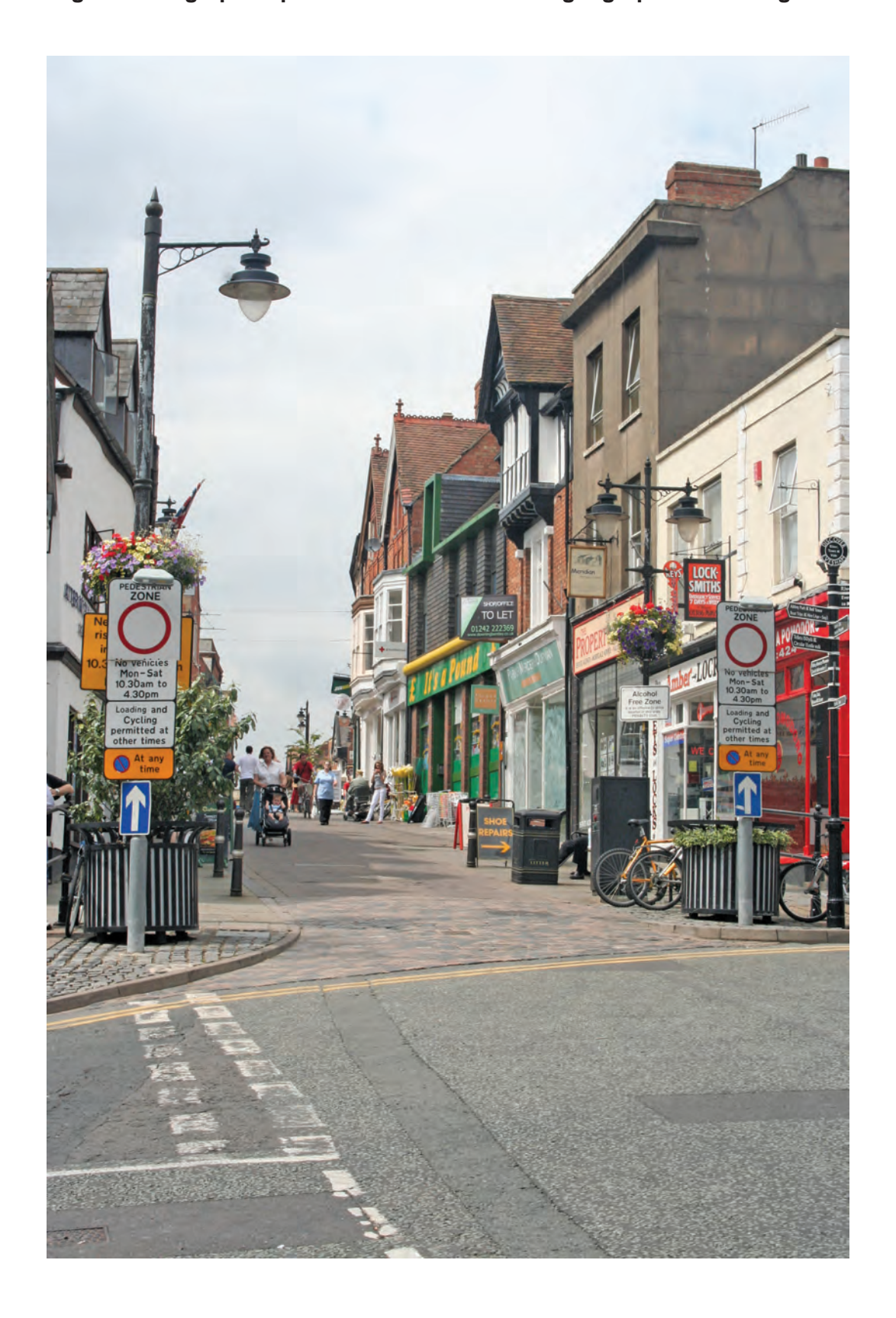
Fig. 3 Photograph of part of the area used for a geographical investigation